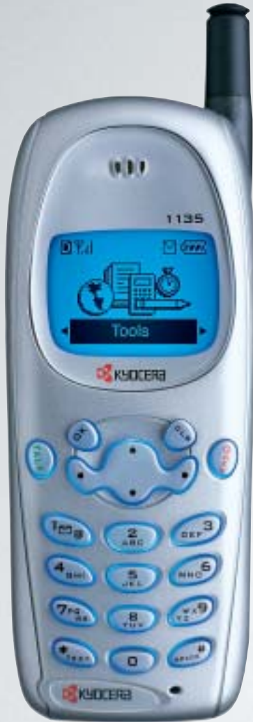
Kyocera 1135 actual size

©2002 Kyocera Wireless Corp., San Diego, California, USA. All rights reserved. Kyocera is a registered trademark of Kyocera Corporation. The Genuine Accessories by Kyocera logo is a trademark of Kyocera Wireless Corp. PureVoice is a trademark of QUALCOMM Incorporated. All other marks are held by their respective owners.