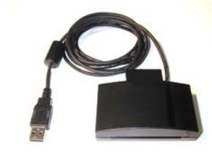
Service Card Reader