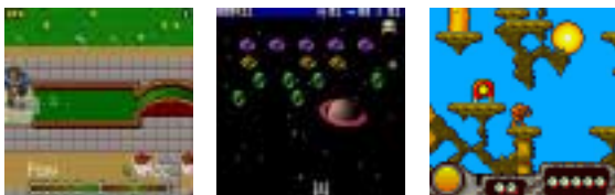
Figure 3. Gaming in the Z200/Z208. From the left: Mini Golf, Alien Scum and Honey Cave.

In addition to impressive graphics and sounds, the Z200/Z208 is also equipped with force-feedback functionality, a popular feature of many games that are developed for mobile phones today.