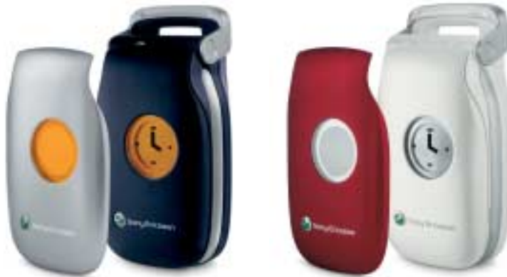
Figure 1. Z200/Z208 Style-Up™ front covers

The Style-Up™ covers can also be complemented with a matching wallpaper, pre-stored in the phone or downloaded from mobile Internet.