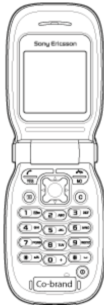
Figure 2. Co-branding on the Z200/Z208

It is possible for a co-brand inlay to be placed on the front of the phone, in the area below the keypad. Sony Ericsson offers high quality print on the co-brand inlay, with good resistance to external stress.