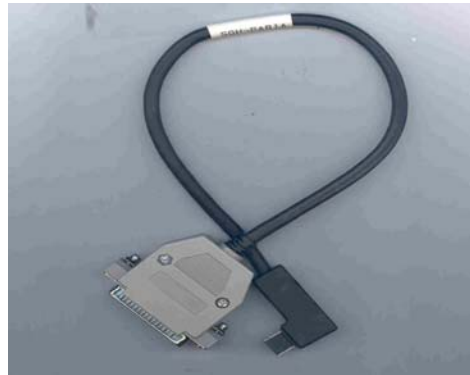
Test Cable (GH39-00499A)