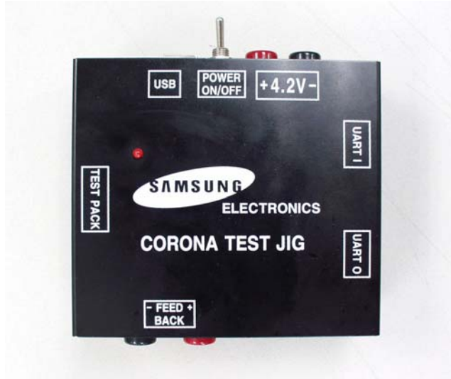
Test Jig (GH80-03306A)